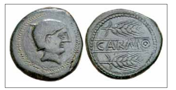
Fig. 8. A bronze coin minted in Carmona, Spain c. 200-150 BC showing a helmeted male and the abbreviation 'CARMO' between two ears of wheat.

In conclusion there is a sad irony between the Buen Jesús 's religious dimension and the inability of a divine presence to protect the ship from the great hurricane that sunk it in the Straits of Florida on 5 September 1622. On its outward journey Juan de Céspedes had consigned a tapestry depicting the souls of purgatory to the Buen Jesús , which was bound for the city of Nueva Cordoba and, ultimately, on to Captain Antón Suarez at the lagoon of Maracaibo in northwest Venezuela (Kingsley, 2013: 133). On its return voyage officials from the newly convened Sacred Congregation of the Propagation of the Faith, dispatched by Pope Gregory XV, may have met their fate on the Tortugas ship.