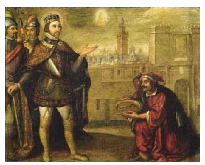
Fig. 2. King Ferdinand II receiving the keys to Seville from Axataf, the city governor of the Moors. Wall painting in Seville Cathedral, Spain, by Francisco Pacheco, 1634.