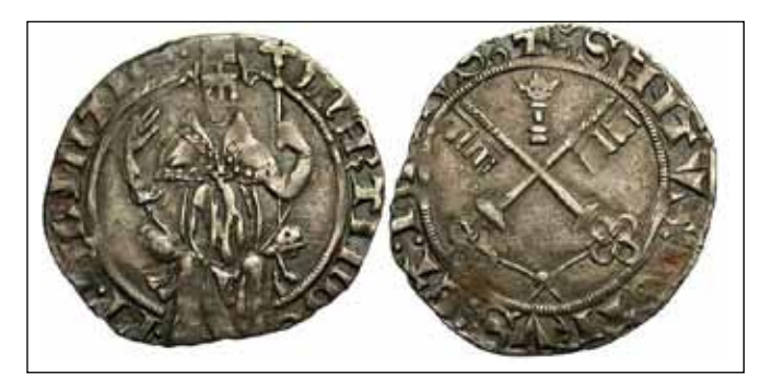
Fig. 6. A coin minted in Avignon, France, under Pope Martin V (1417-31) showing him on a lion-headed throne wearing the papal tiara. On the reverse, the legend 'SANTVS. PETRVS:ET:PAVLVS' enclosing the keys of heaven.

The popular artistic use of the keys of heaven expanded in the second half of the 13th century onto banners, seals and coins. As the keys of St. Peter they symbolized the