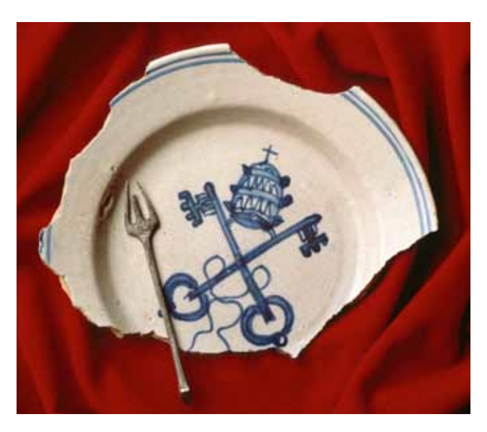
Fig. 1. One of two Seville Blue on White tin-glazed plates from the Tortugas shipwreck painted with the arms of the papacy: the triple crown surmounting the crossed keys of heaven (Type 2A, Rim Style G/Base Style F, inv. 90-1A-000577).

Dual concentric blue lines encircle the plate's rim edge. The blue glaze is slightly blurred. On one plate a large air bubble has broken through the white glaze of the body wall at the transition between the rim and base. The fine and hard clay fabric has a slight yellow cast and no obvious inclusions. The finish displays surface crazing reminiscent of Chinese porcelain. Sherds from a second plate with a comparable design, clay fabric, glaze texture and color were also recovered from the wreck (Flow, 1999: 46).<sup>1</sup> Inductively-Coupled Plasma Spectrometry (ICPS) analysis conducted on the Tortugas wreck ceramics identified the Type 2A plates as originating in Seville (Hughes, 2014).