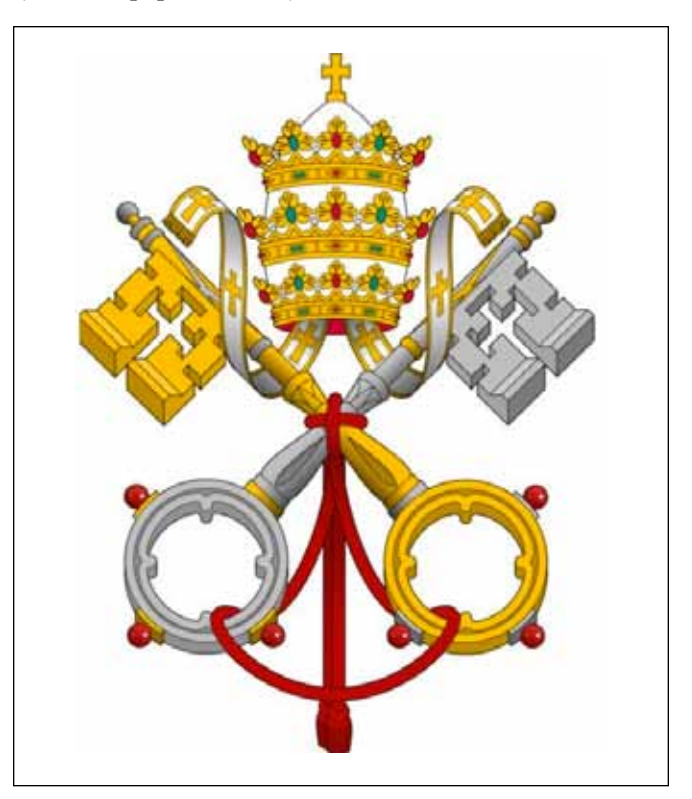
Fig. 3. The classic design of the papal seal with the tied gold and silver keys of St. Peter surmounted by the triple crown tiara.

The crossed keys serving as the emblem of the papacy symbolize the keys of heaven entrusted to St. Peter (Matthew 16:19). The motif developed into the choice symbol of papal authority because in biblical narratives the