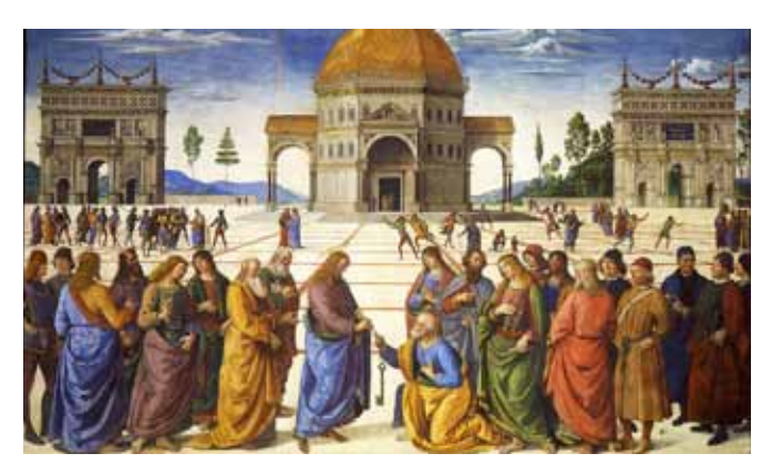
Fig. 4. A fresco in the Sistine Chapel, the Vatican, depicting Christ Handing the Keys of the Kingdom to St. Peter by Pietro Perugino, 1481-83.

apostle Peter "received the keys of the kingdom of heaven, the power of binding and loosing is committed to him, the care of the whole Church and its government is given to him" ( Epist. , lib. V, ep. Xx). The saint is often depicted in Roman Catholic and Eastern Orthodox paintings and other art holding a key or a set of keys (Fig. 4). The ground plan of St. Peter's Basilica in Vatican City, Rome, is also generally described as being key-shaped.